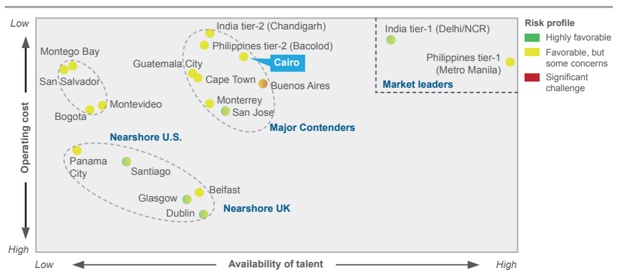
Exhibit 3 provides Everest Group's Maturity-Arbitrage-Potential (MAP) Matrix<sup>™</sup> for leading English contact center services locations, including Cairo, based on their costs vs. availability of talent and risk profile.